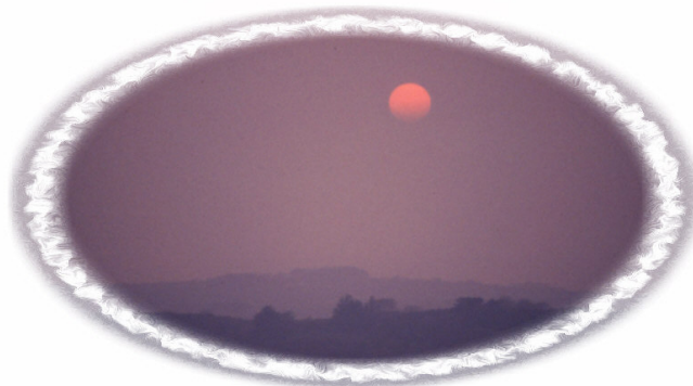
May Sunset in West Cork

In of itself the story of the Finns is unremarkable in that it mirrors the story countless other of Irish tenant farmers and their families. However this of itself is a remarkable story, recalling the struggles of a people to overcome foreign domination, surviving famine and injustice to take possession once again of the land of their forefathers and build an independent and prosperous Irish nation.